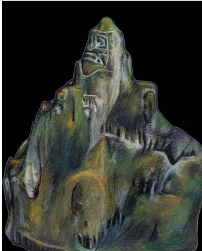
13. The Great God Jocahu, carved on a stalagmite at Fountain Cavern (Painting by Penny Slinger®)

There are many explanations for their rapid dying off in the islands of the West Indies suggested in the text books. Spanish cruelty was Protestant propaganda, and not the entire reason. The Amerindians were fatally susceptible to such minor common European diseases as small pox, measles, and even the common cold. They possessed no immunity to these new diseases. More of them died from these infections than from the guns and swords of the Spaniards. The Amerindian wars with the English, French and Spanish intruders, and their enslavement in the Spanish mines, are all well