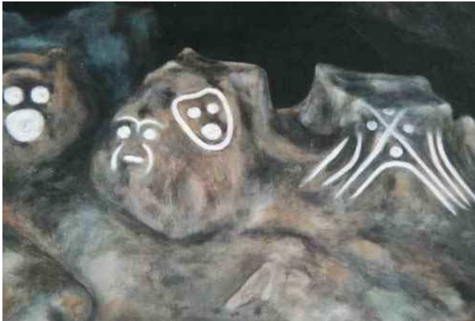
2. Fountain Cavern petroglyphs (By Penny Slinger®)

valuable petroglyphs left behind by the original inhabitants.