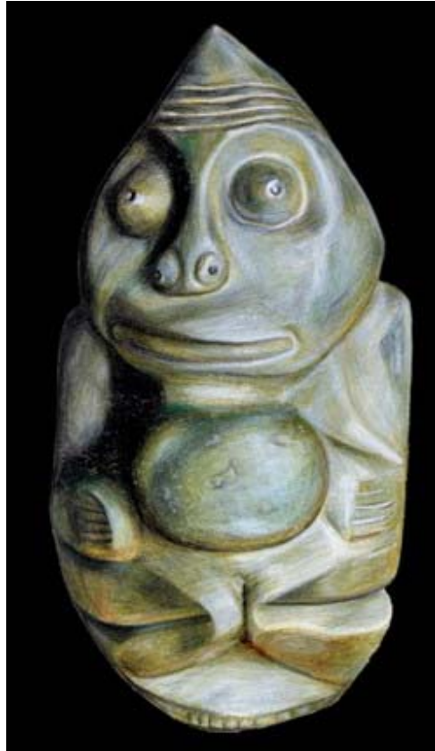
7. A zemi (By Penny Slinger®)

(see ill 7 for one with character), were represented in the form of heads of lizards, snakes or bats made from chalk or baked earth or carved on rocks.