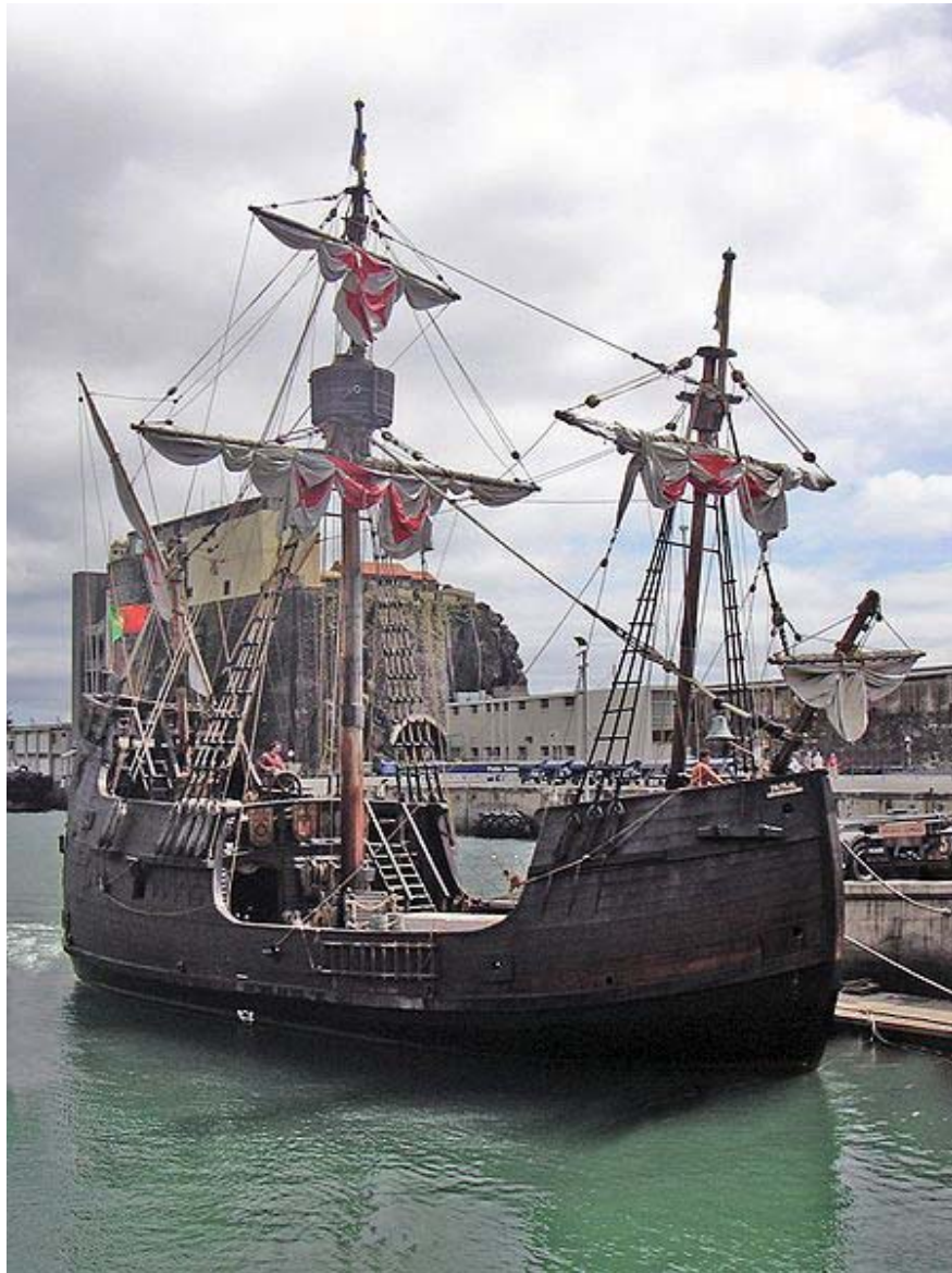
4. Replica of Columbus' Santa Maria

supposedly quite different and opposed Amerindian cultures. They called them the Caribs and the Arawaks. 8