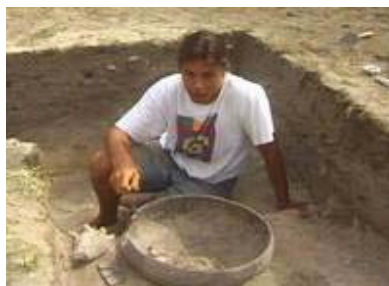
1. Amerindian pottery bowl found at Sandy Ground

The first European and African settlers arrived in Anguilla in 1650. There is no mention in the early accounts of finding any Amerindians occupying the island at the time of settlement. There is plenty of evidence of Amerindians occupying the island at an earlier time. Fragments of pottery are found at sites around the island (see ill 1). Middens, ancient rubbish heaps of broken conch shells, pottery and other discarded objects, are occasionally revealed on or near the beaches. Professionally conducted archaeological digs now take place.