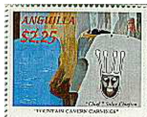
11. Solar Chieftain petroglyph at Fountain Cavern (Anguilla stamp)