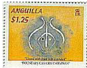
9. Lizard Fertility God petroglyph from Fountain Cavern (Anguilla stamp)

of gender differentiation in language is well understood. 10 It suggests that the relationship of a boy with his father is different to the relationship of the same father to his daughter. The son and daughter understand each other perfectly when they speak to each other about their father using the words proper to their gender. This does not mean they speak different languages, or that the men captured the women from foreign tribes.