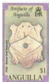
10. Sandy Ground shell frog (Anguilla stamp)