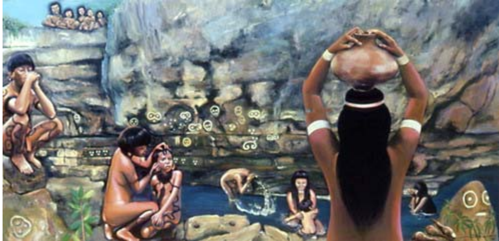
3. Big Spring (By Penny Slinger ® )

on the hillside under North Hill. Their artefacts are found in that area.