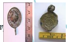
Artefacts recovered from the site of the Buen Consejo include religious medallions (left), eating utensils, and an English cloth seal (right). These small objects provide a rare glimpse into life in the 18 th century.

The UNESCO Convention on the Protection of Underwater Cultural Heritage came into force this January. In May 2009 the AAHS endorsed the full convention and its annex!